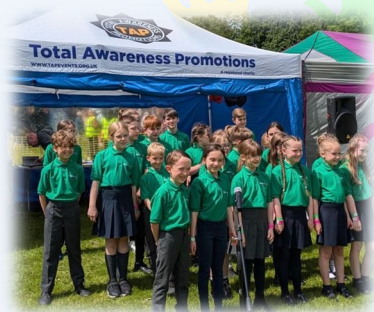
Halifax Gala Victoria Theatre

In June they were invited to perform at the Calderdale Music's "Voices Together" event at the Victoria Theatre, Halifax. The audience loved their performance of "Feel Good" and the children all enjoyed joining in with choirs from other Calderdale schools in songs such as "Power in Me" and "This is Me."