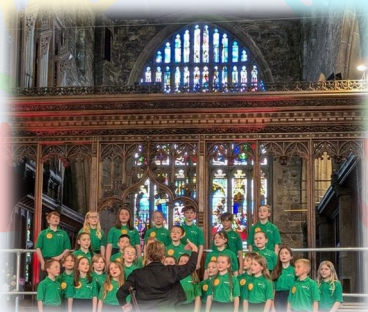
Music for the Many Festival